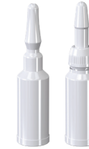
6 ml* / 7 ml H: 81 mm