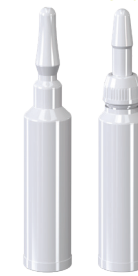
10 ml H: 101 mm